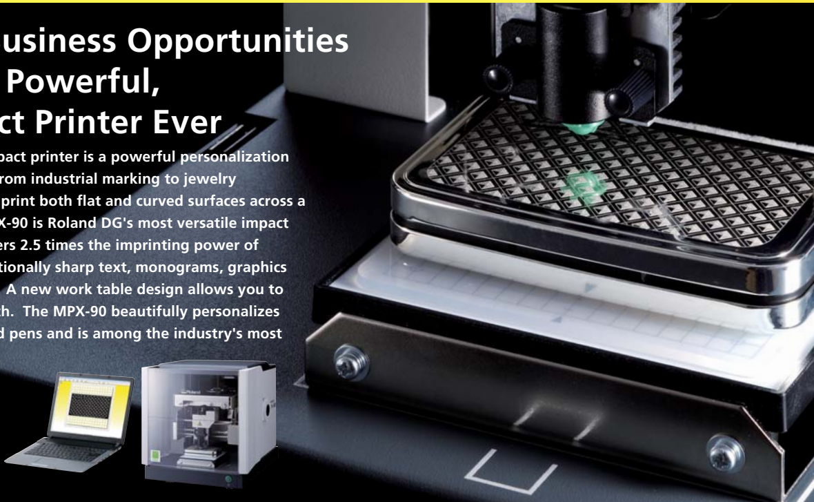
Celebrate special occasions with unique personalized gifts your customers will cherish.

Roland DG's MPX-90 desktop impact printer is a powerful personalization device for applications ranging from industrial marking to jewelry engraving. With the ability to imprint both flat and curved surfaces across a wide range of materials, the MPX-90 is Roland DG's most versatile impact printer to date. The MPX-90 offers 2.5 times the imprinting power of previous models to create exceptionally sharp text, monograms, graphics and photos on metallic surfaces. A new work table design allows you to mark items of virtually any length. The MPX-90 beautifully personalizes jewelry, dog tags, key chains and pens and is among the industry's most cost effective industrial marking tools for serial number plates, data plates and more. Designed for ease of use, the MPX-90 fits on your desktop and comes complete with design software.